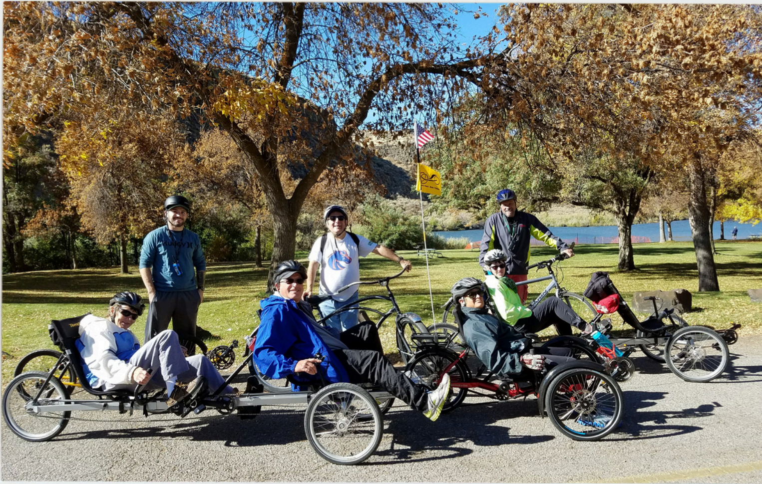
Bike Ride on the Greenbelt!

Meeting Location: Kirstin Armstrong Municipal Park