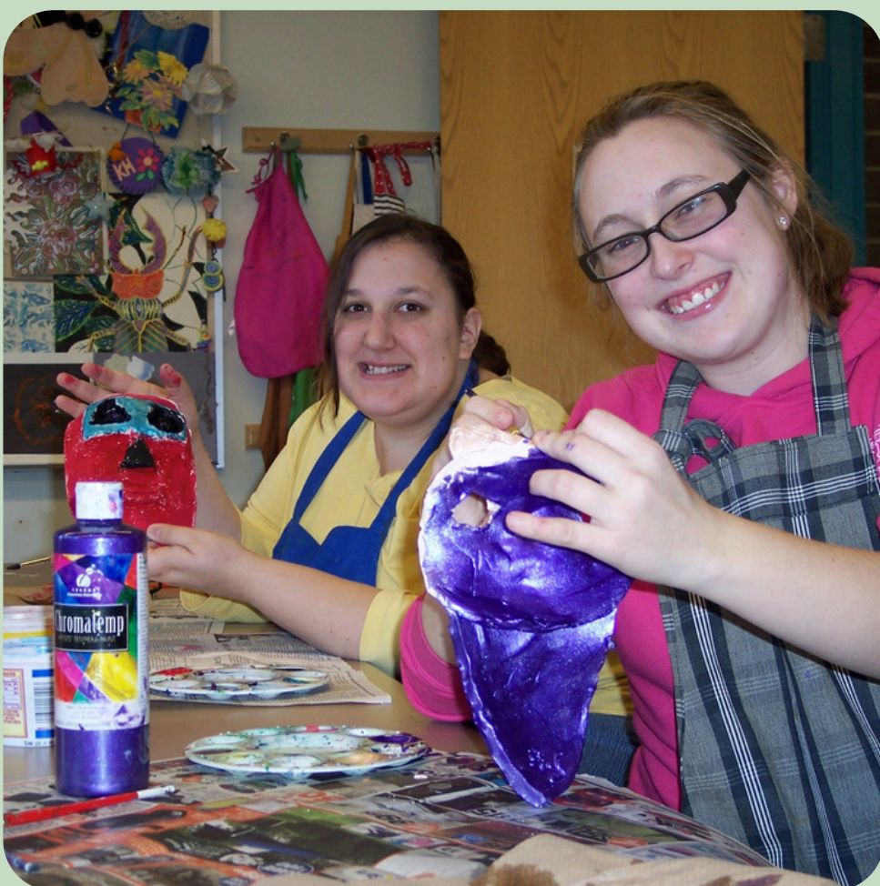
Dine and Decorate