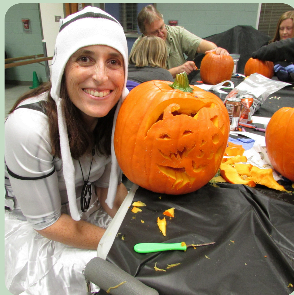
Pumpkin Carving and Lunch