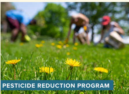
PESTICIDE REDUCTION PROGRAM

GOAL: Increase actively managed native habitat areas in improved park sites by 30% across Boise by 2030.