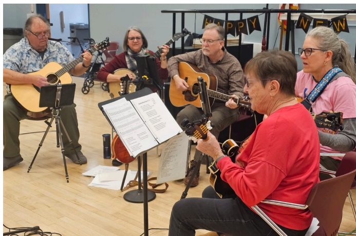
Clockwise from top left: Members of "The B Team" perform during lunch.

We celebrated the new year with "bubbly" toasts and good cheer.